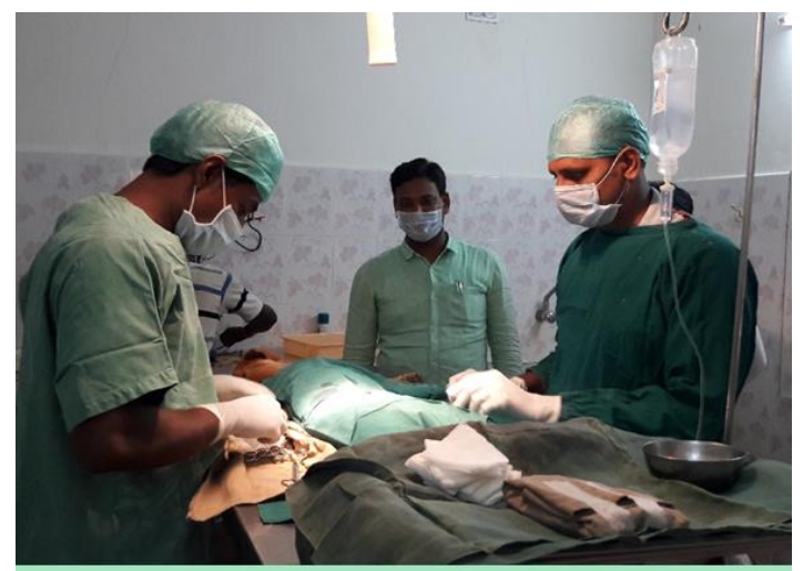
We are so grateful to Help Animals India and Animal Care Austria for their ongoing contributions which help fund our weekly ABC Surgeries.

The animal rights/welfare view is that street dogs are part of the community with ties to local people, having different functions and they should not be seen as a threat but as a valuable part of daily life. Just like the human population they deserve first aid