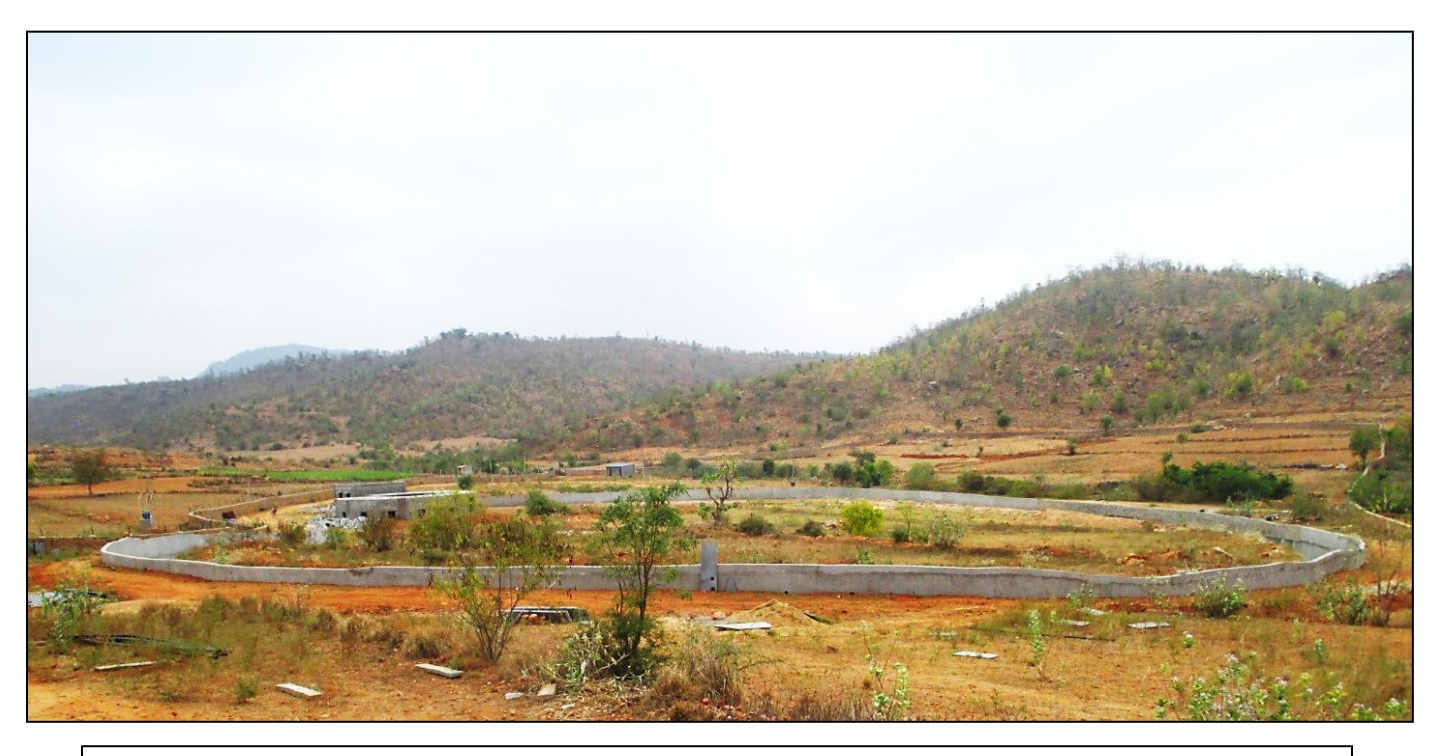
The new 18-acre Wildlife Rescue Centre at the foothill of the Reserve Forest

Contributions to create a corpus fund. At present we have no financial security/back-up system for our 450 animals and 31 employees. Please remember us in your will.