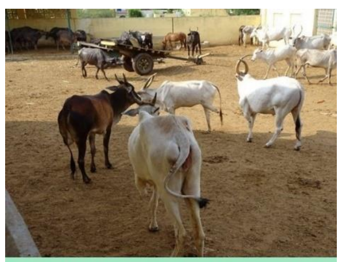
Birds of a feather flock together; or in this case, three-legged cattle flock together four together in one picture! Looks like they find comfort and community in each others' company.

It is thanks to our main donors; "the Marchig Animal Welfare Trust UK", and "Help Animals India", US, Vital Solutions, Singapore, and individual donors that we manage year after year.