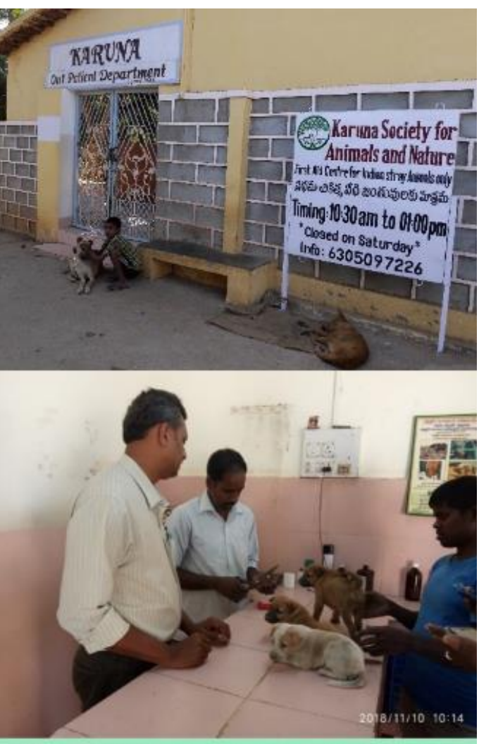
Our Clinic is busy every day with a line of patients. Here, several puppies are being treated for skin problems.

From the inception of Karuna Society all injured and sick animals have received first aid and inpatient care free of charge. Over time, as more people became aware of our services, more and more dogs and cats arrived at our doorstep, not only from Puttaparthi but also from far away and not just stray animals but also owners with breed dogs. Although some owners donated a small amount, real payment cannot be asked for as we are a non-profit organization. For the last few years the pressure has been growing on the OPD to such an extent that the inpatient animals were getting less attention. Then we knew that we needed to change! The most important point is that we are NOT A PET CLINIC but a rescue centre for stray animals only. In November 2018 after much discussion, we implemented new rules for our Out-Patient dep. The new signboard is ready stating the hours and regulations of the clinic.