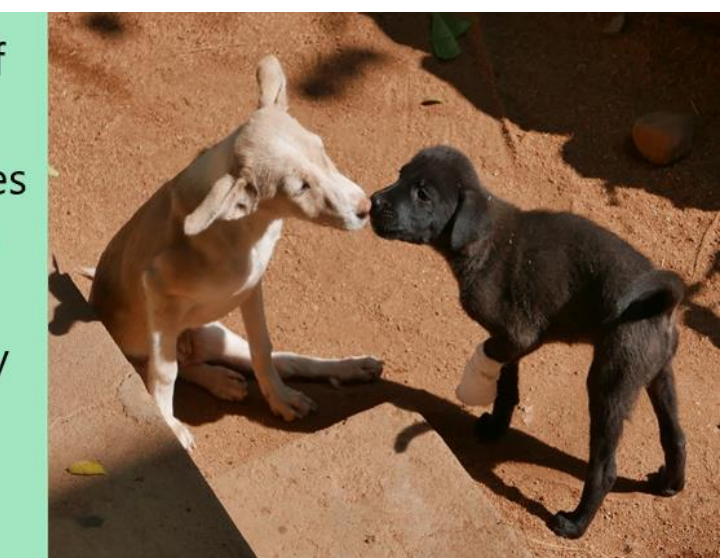
This is one of the many accident cases that come to our clinic for first aid every day.

7. The Municipality will implement the ban on illegal breeding of dogs for profit as it causes untold suffering to the breeding bitches and many puppies end up discarded on the road, adding to the stray dog population.